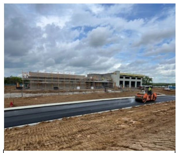
Asphalt progress at 99<sup>th</sup> Street (previously 102<sup>nd</sup> Street)