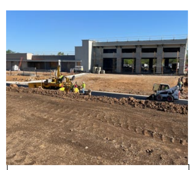
Building and concrete approach progress