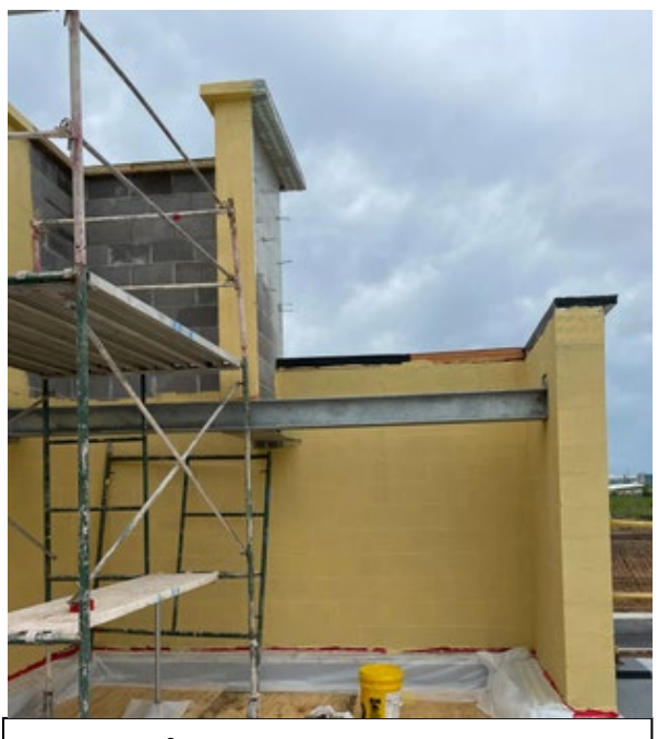
EIFS at roof progress