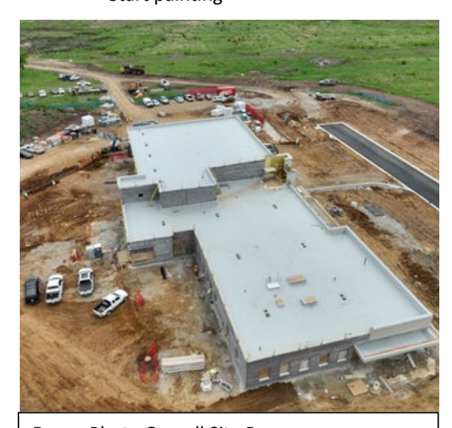
Drone Photo Overall Site Progress