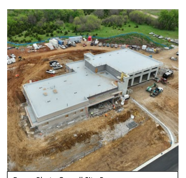
Drone Photo Overall Site Progress