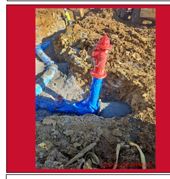
Water Main Installation Complete to Fire Hydrant at South Side of Building