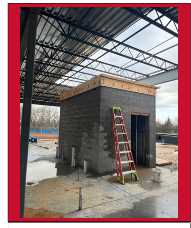
Storm Shelter Lid